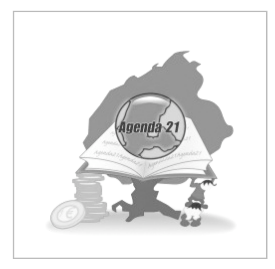
Agenda 21 mascot in Spain

Local Agenda 21 (LA21) is the process of drawing up and implementing local sustainable development plans. It was first described in Agenda 21 - the global blueprint for sustainability that was agreed at the United Nations Conference on Environment and Development in 1992 in Rio, Brazil. Chapter 28 of Agenda 21 identifies local authorities as the sphere of governance closest to the people, and calls upon all local authorities to consult with their communities and develop and implement a local plan for sustainability - a 'Local Agenda 21'.